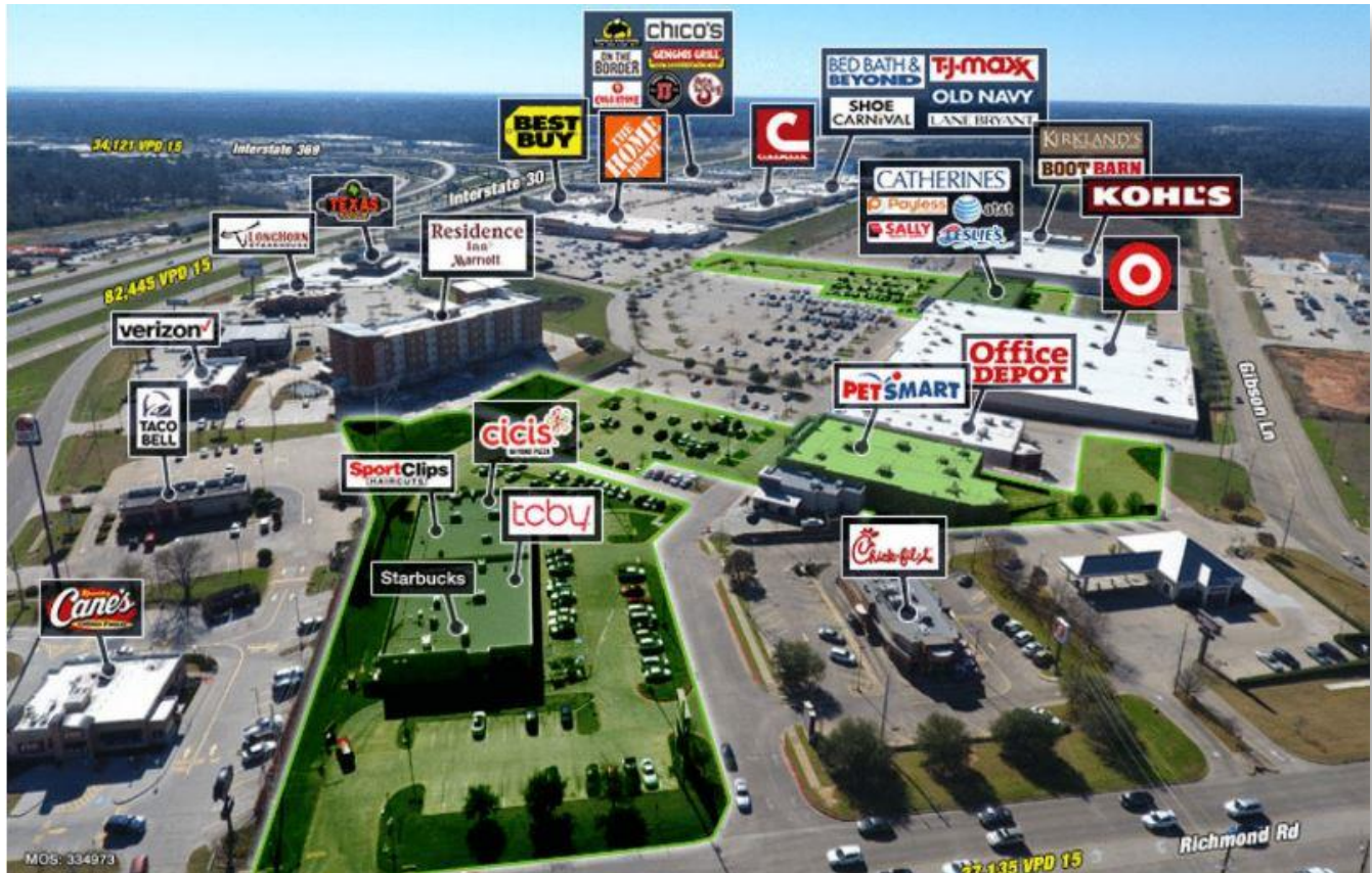
Overhead and Nearby Businesses

Richmond Ranch 2525 Richmond Road | Texarkana, TX 75503